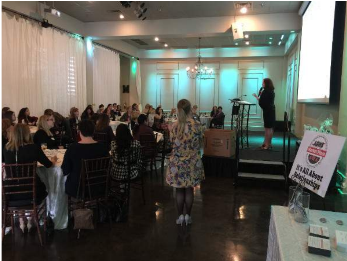
Crescent City Connection Express Network members gather for the March meeting at The Cannery, 3803 Toulouse St.